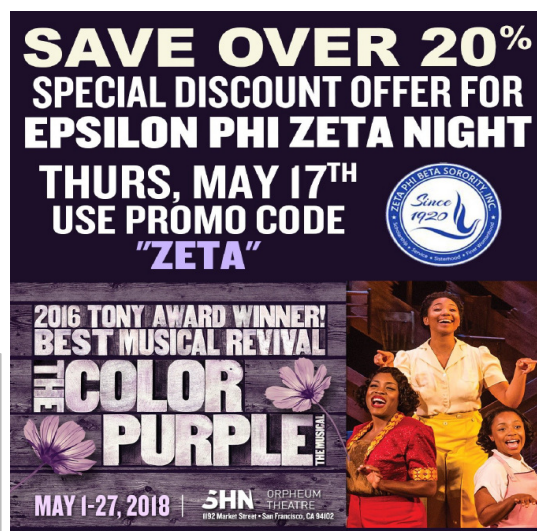
Right: Community engagement flyer with The Color Purple musical.